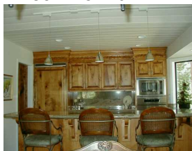
832 Donna Dr.